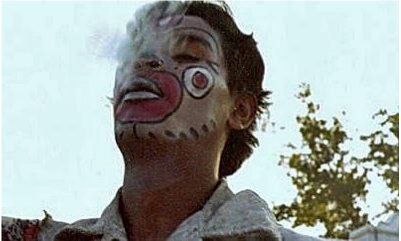
Guadalajara, Jalisco México 1977